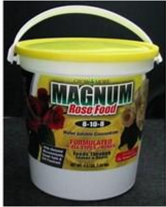
Magnum Rose Food Powder 8-10-8 1.5lbs