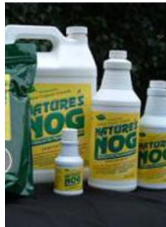
Natures Nog totally organic, natural compound designed to enhance root formation, increase vascular strength, promote green color, quart