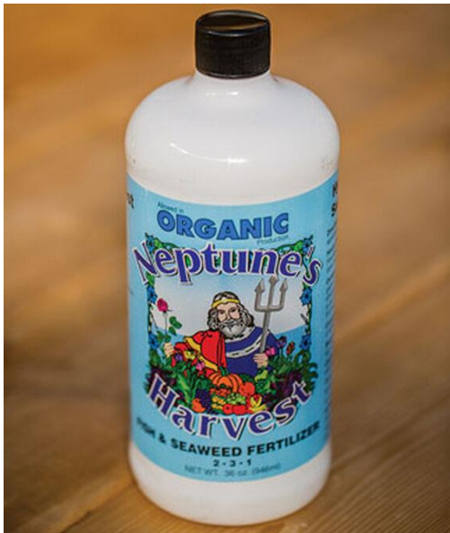
Organic- Neptune's Harvest quart 2-3-1

Examples of granular inorganic "balanced" Fertilizer.