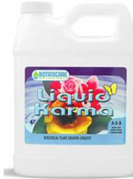
Organic. Produces beneficial results during every phase of plant growth. Starting with seed germination and following through to vegetative growth, budding and flowering, 1-1-5 quart