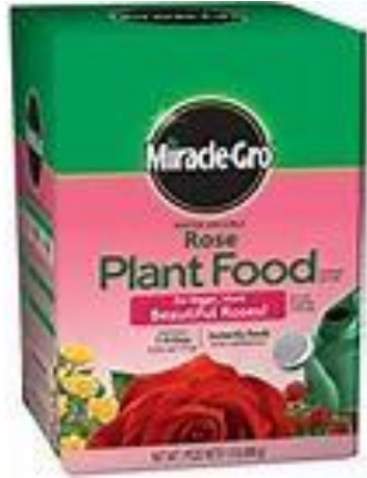
Inorganic Powder 1.5 lbs