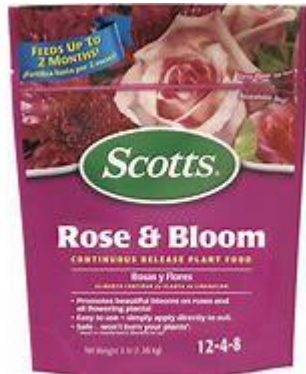
Scott's Combined Inorganic & organic 12-4-8 3lbs