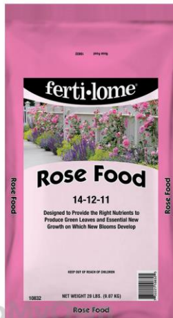
Ferti-lome Inorganic Granular 14-12-11. 20lbs