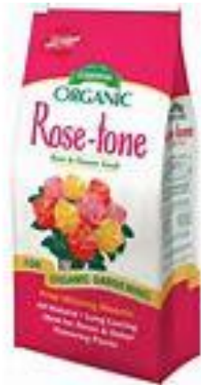
Rose-tone Organic – Granular 4-3-2. 18lbs