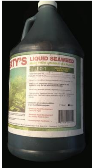
Organic. Beaty's seaweed with nutrients also carries bacteria, viruses, and fungi. 1-gallon